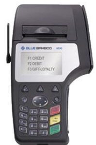
The H50 Loyalty in a Box POS Terminal

Our solution includes the supply of POS terminal(s) or Windows based POS software, Cards and access to our secure server. All you need is access to a the internet to upload your valuable transaction details to our secure server.